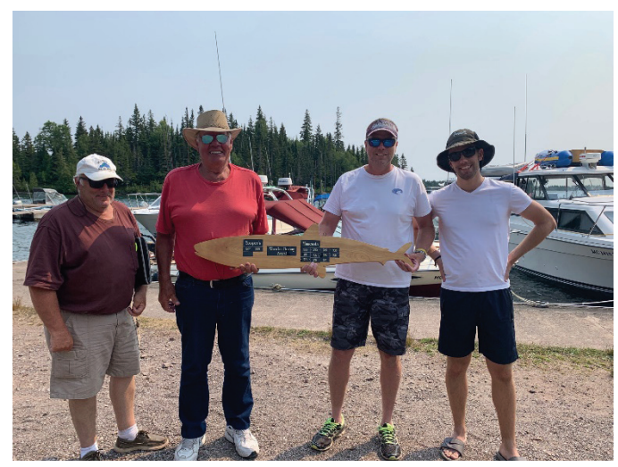
The Minnesota Fishermen with the Wooden Herring Award

The Minnesota fishermen took the Wooden Herring Award with a total weight of 77.07 lbs. They have retained the Wooden Herring Award for 2022. Congratulations to the Minnesota Fishermen!